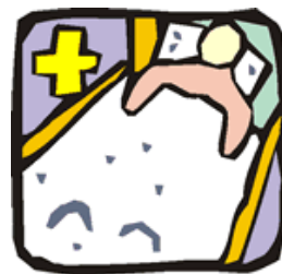
Smokers have a higher chance of developing oral cancer