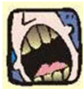
Smokers tend to have stains on teeth

The chance of smokers developing periodontal disease is 5 times higher than that of non-smokers