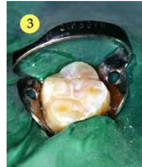
Light curing to harden the sealant