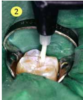
Application of sealant